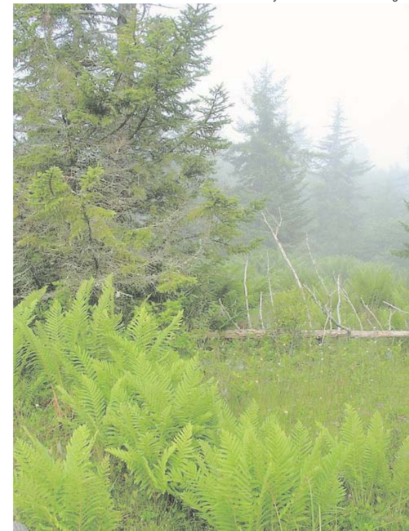
Cranberry glades