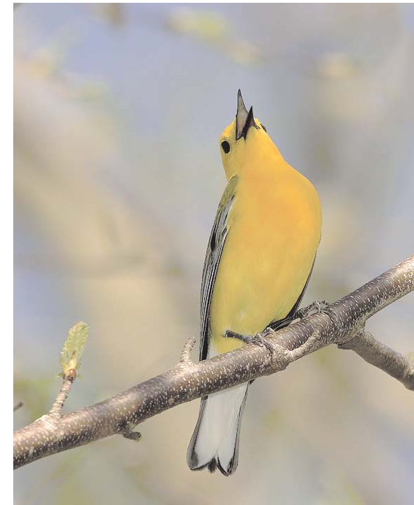
Prothonotary warbler

Potomac Valley Nature Photographers (PVNP) is a group within Potomac Valley Audubon Society (PVAS), a 501(c)3 organization and a member of the United Way.